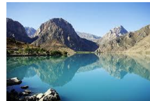
Iskanderkul 3,4 км 3