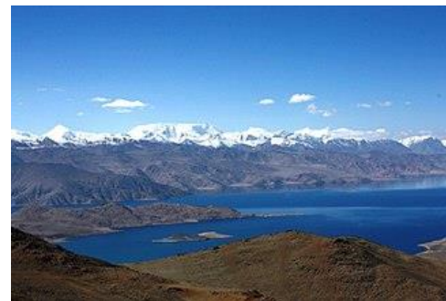
Karakul 27 км 3