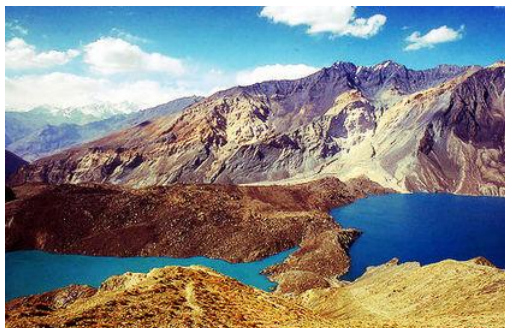
Sarez 17 км 3