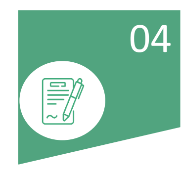
"Creating Guidelines for ARRDFM on ESG Risk Exposure, Information Disclosure and ESG Risk Management."