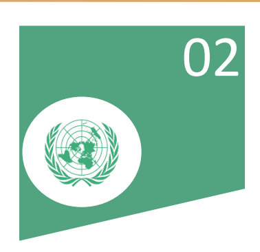
The Sustainable Development UN Goals are a global call to action: to end poverty, protect the planet and ensure that all people live in peace and prosperity by 2030.